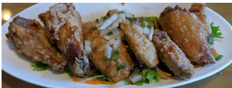
Cánh gà chiên nước mắm 5