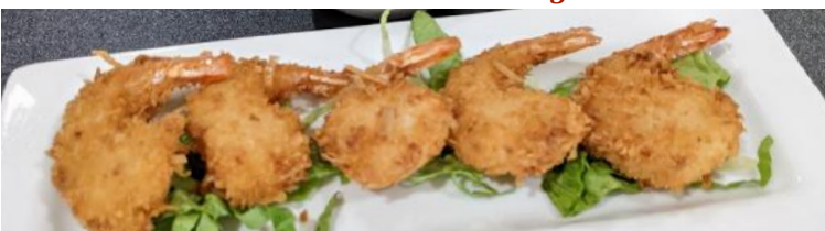
Tôm Dừa (Coconut Shrimp) 8

Pork, lettuce, and vermicelli noodles rolled in fresh rice paper served with